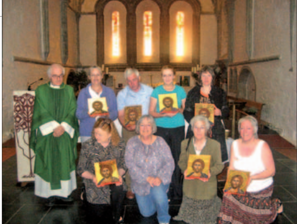
■ Participants of the workshops