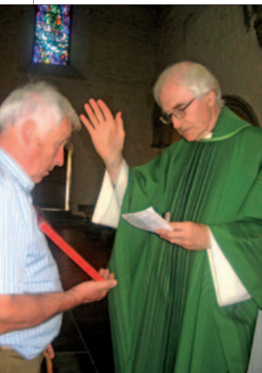
■ Blessing of the icon and its creator

It will be difficult to tell of all the amazing "God incidences" that have come about just this summer alone, and all the little miracles the Lord has brought about. Lives transformed, faith renewed for pilgrims coming to this holy place. For me Ballintubber is a "thin" place where heaven touches earth, and Church Island where I lead the Icon Retreats is an oasis of peace. It