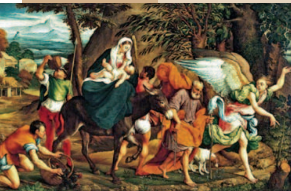
■ Jacopo Bassano, Flight Into Egypt , 1538