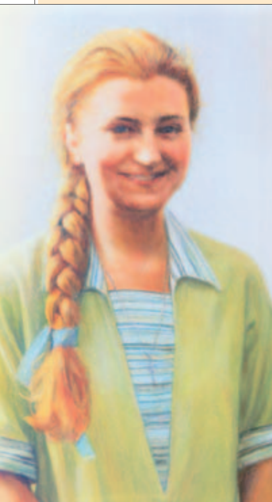
■ Sister Faustina as a young girl

Artists depict angels as extremely beautiful young men of great strength. They usually have luxurious robes like the seven angels from the Book of Revelation “wearing pure white linen, fastened round their waists with belts of gold” (Rev 15:6). They also have wings and hold some attributes in their hands. St Faustina used few words when describing her guardian angel, she wrote only of “the bright and radiant figure.”