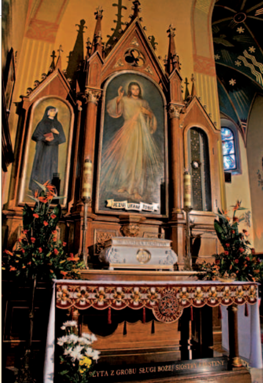
■ The altar with St Faustina's tombstone, Poland