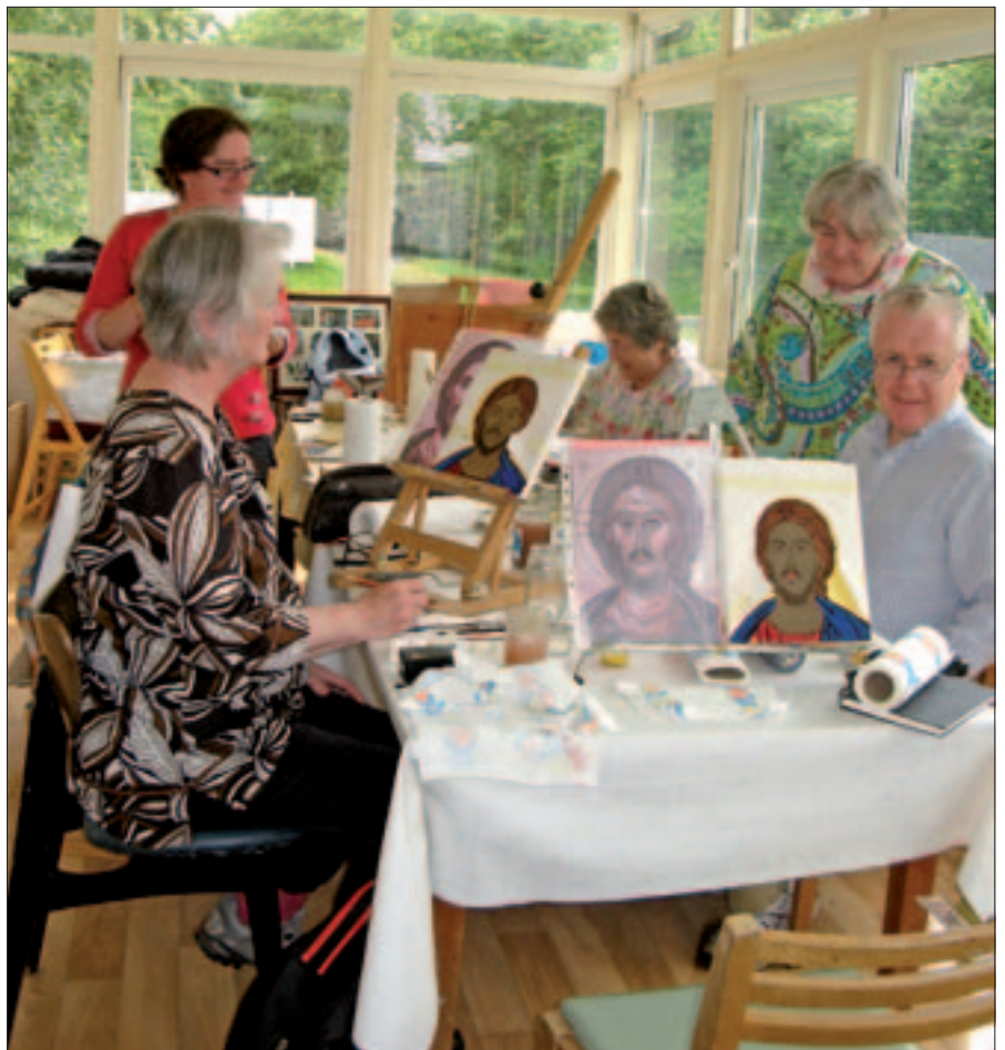
■ Workshops in writing icons

In fact as St Francis would say I am just "a useless servant". That does not mean it is not my deepest desire to aspire to holiness. Indeed the Holy Father's words so frequently remind each one of us of our call to holiness, in our various vocations in life whether married, single or consecrated. St Francis was so aware of this too, and it is I feel, a reason for the continuing devotion for this saint who chose to walk humbly ►