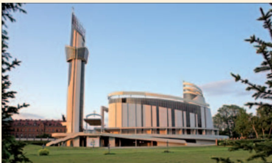
■ Sanctuary of the Divine Mercy, Cracow-Łągiewniki, Poland

Love is the reason I'm here, alone in my hermitage, with no TV or mod cons, living a very simple life of prayer. "A condition of complete simplicity, costing not less than everything" as