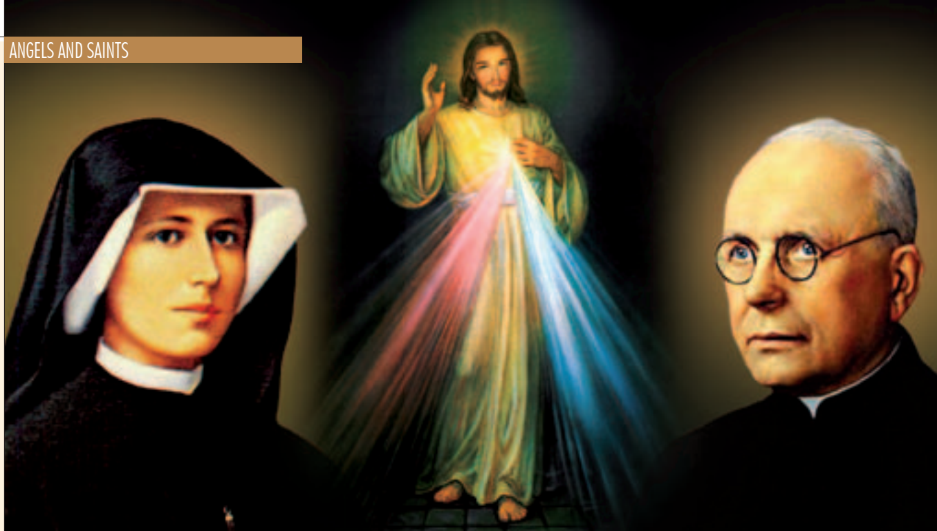
■ St Faustina and her confessor, Blessed Father Michael Sopoćko