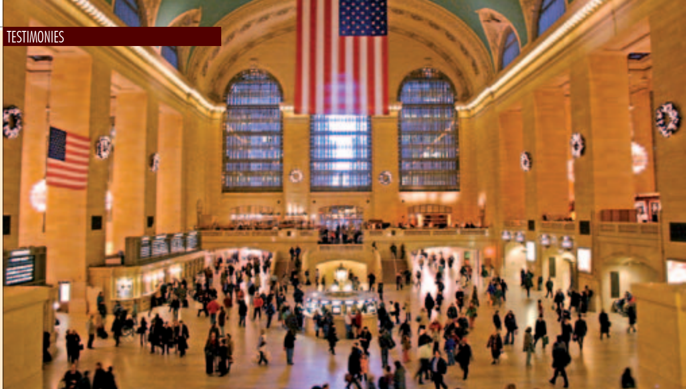
■ Grand Central Station, New York

A number of years ago I was a missionary in Bolivia and had to undertake some preaching for the missions in the States. I travelled by train from Boston to Grand Central station in New York and was on my way to the Mary Knoll Fathers to visit a sick priest somewhere along the Hudson River. When I arrived in Grand Central station I was completely disorientated and lost.